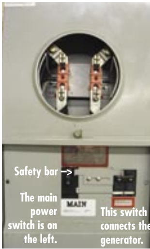
In this photo, the safety bar, which is locking out the generator switch, prevents backfeeding to the power lines.

Your generator might not be large enough to handle the load of all the lights, appliances, TV, etc. at one time. To prevent dangerous overloading, calculate wattage requirements correctly (see chart at far right).